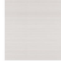
Aluminum Natural Anodized - 00